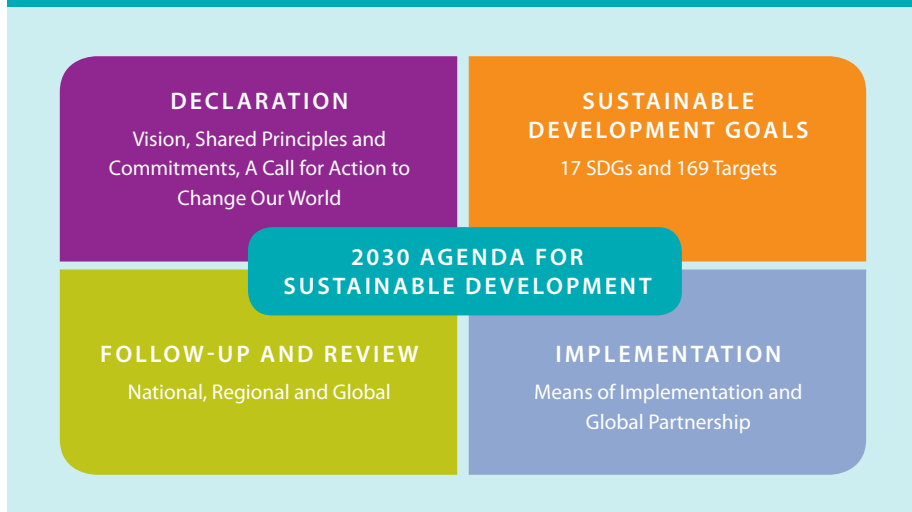
FIGURE 1. THE 2030 AGENDA FOR SUSTAINABLE DEVELOPMENT AND SDGS