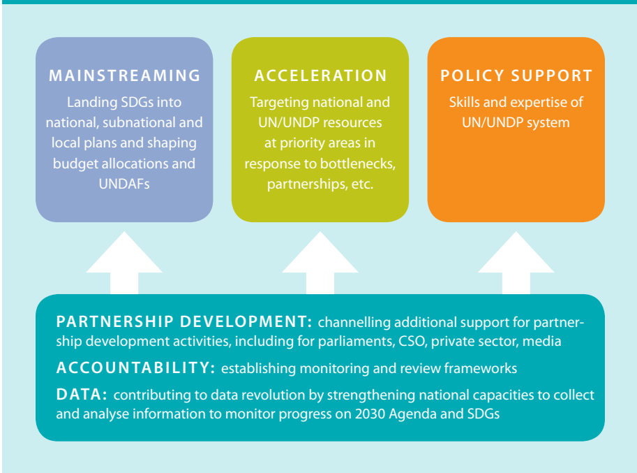
FIGURE 2. MAPS: MAINSTREAMING, ACCELERATION AND POLICY SUPPORT FOR THE IMPLEMENTATION OF THE 2030 AGENDA

Source: Adapted from UNDG. Mainstreaming the 2030 Agenda for Sustainable Development – Reference Guide to UN Country Teams – February 2016